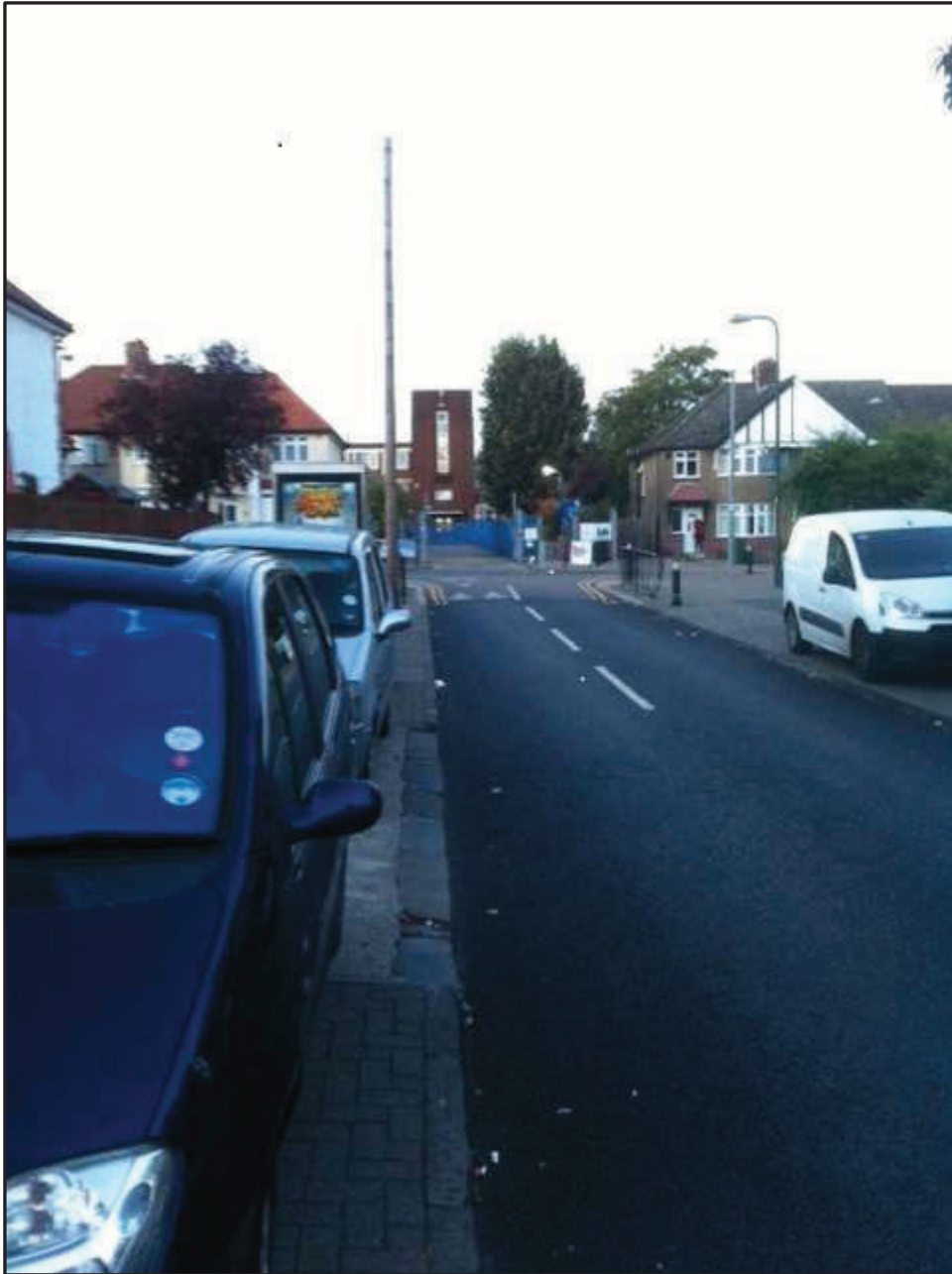
Image MW/02 shows the view of the school entrance taken from Chalfont Avenue