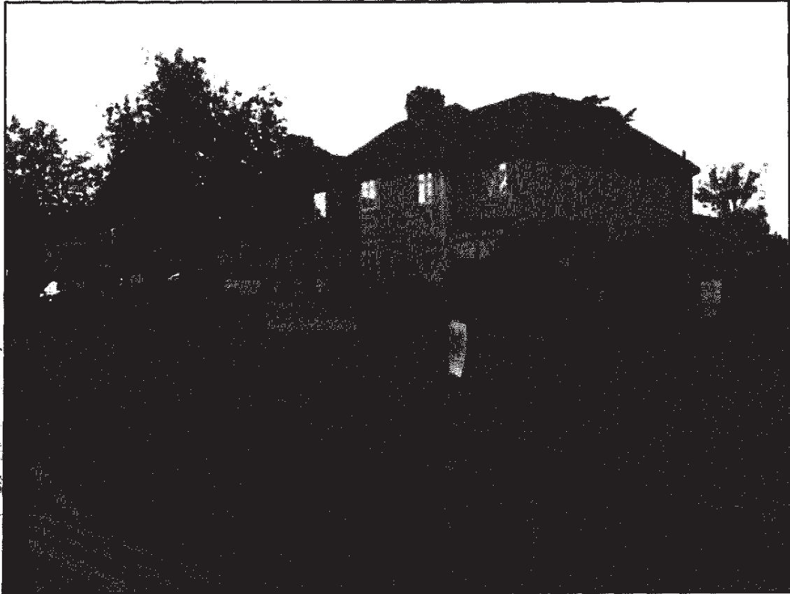
Image MW/03 shows the view of the school entrance looking partially along Oakington Manor Drive