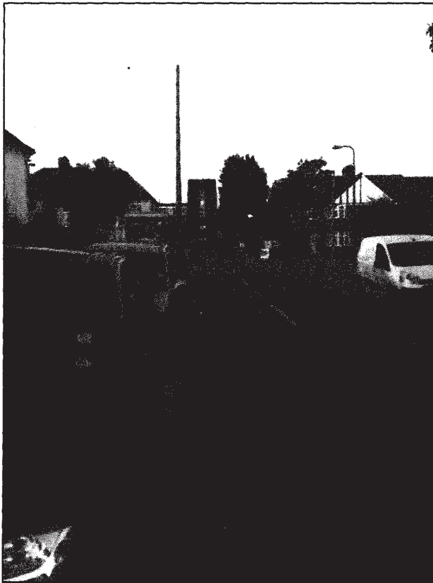
Image MW/02 shows the view of the school entrance taken from Chalfont Avenue