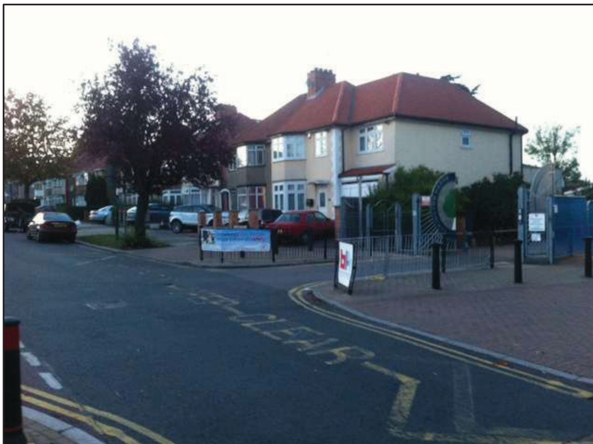
Image MW/03 shows the view of the school entrance looking partially along Oakington Manor Drive